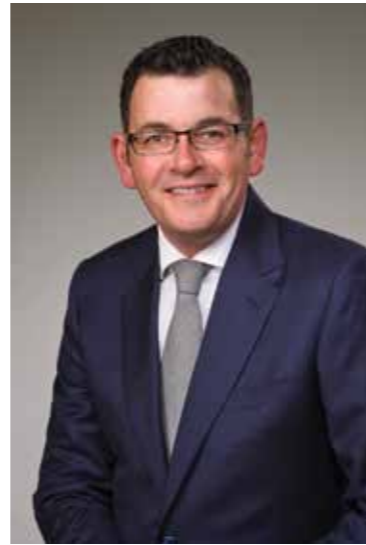
The Hon Daniel Andrews MP Premier

And to those attendees visiting Victoria from interstate or overseas, I hope you enjoy your stay.