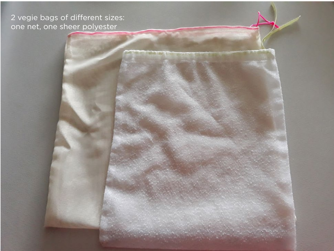
2 vegie bags of different sizes: one net, one sheer polyester

4. Thread the drawstring: Cut a 60 cm piece of cord or ribbon for each bag. Pin a safety pin through one end of the cord or ribbon, and thread it through the casing, easing the pin gently along until it comes out at the other end. Remove the safety pin, and knot the ends of the cord or ribbon. Turn the bag the right way out. Your vegie bag is finished! It can be washed and re-used time after time.