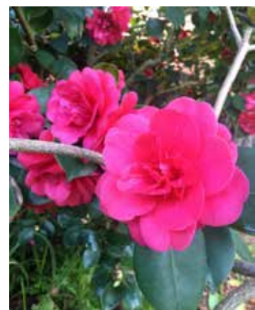
Camellias in Shalini's garden