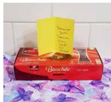
The box of chocolates and accompanying note received by a Drung South member

The thoughtfulness of this reasonably new member of Drung South was a little 'act of kindness' to a fellow member.