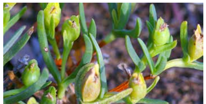
Top Left Dodder Top Middle Quandong Native Peach Top right Sweet Appleberry Above Inland Pigface

Source: 'Flora and Fauna of the Victorian and South Australian Mallee' published in 2015.