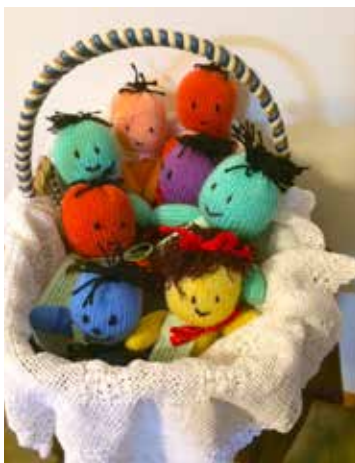
Knitted Jelly Babies

The girls were all delighted by the surprise visit and to receive their Jelly Babies and also knitted headbands they