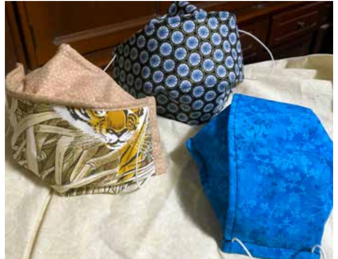
Face masks made by Noble Park members