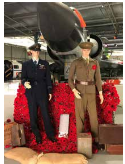
Some of the many poppies members made on show at the Australian National Aviation Museum, Moorabbin Airport, April 2019