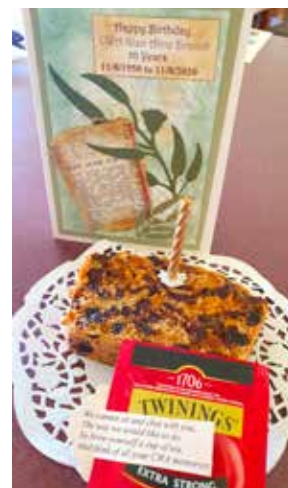
Birthday card and tea bag sent to Glen Alvie members on the branch's 70 th Birthday

We were going to celebrate our 70 th birthday on 12 th August 2020, with an afternoon tea, friends, relatives of past members, fellow Bass Group branch members. This will all have to wait. In lieu we sent each current member a birthday card and a tea bag and asked them to have a cuppa with us.