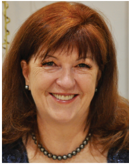
DEPUTY STATE PRESIDENT