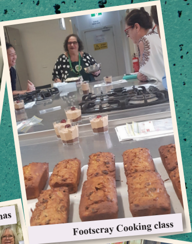
Footscray Cooking class