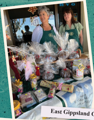
East Gippsland Christmas Fare